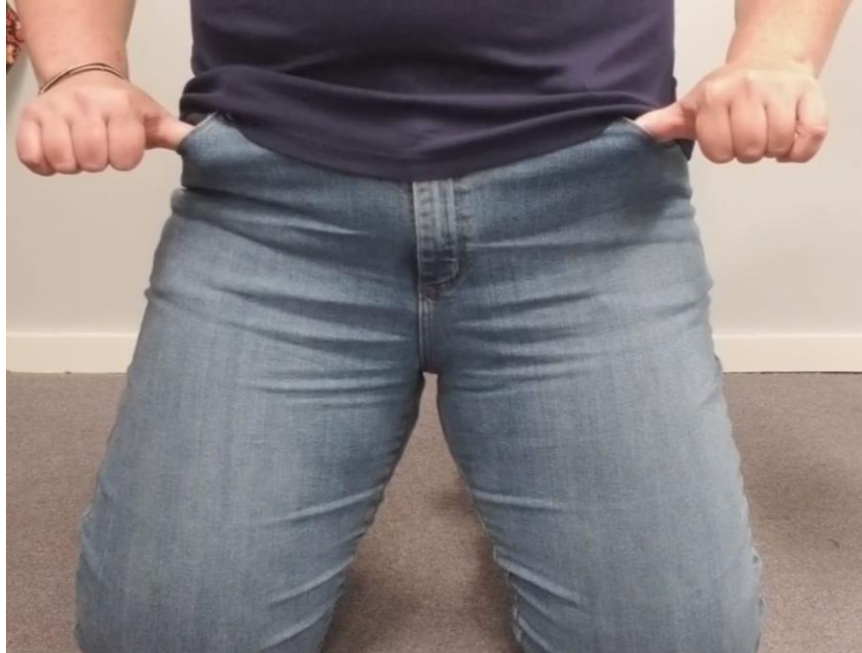
Figure 2 Use your thumb to lift yourself up from the kneeling position. As you rise, push your pelvis forward and allow it to open. You will also feel your glutes contract to help you rise without the momentum of your upper body.