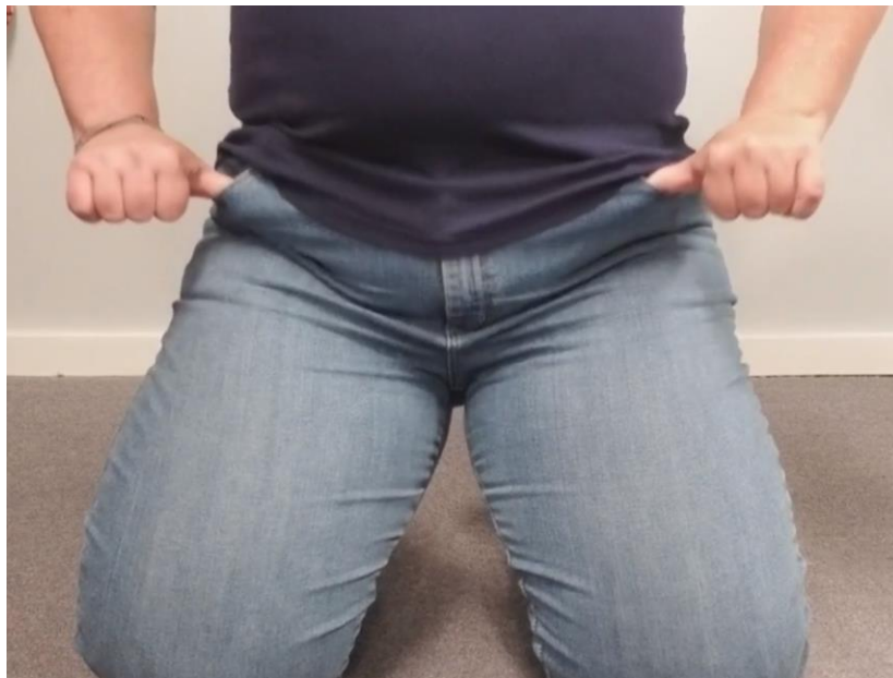
Figure 11 To practice the balanced rising trot put your thumbs in the pockets of your jeans or other pants.