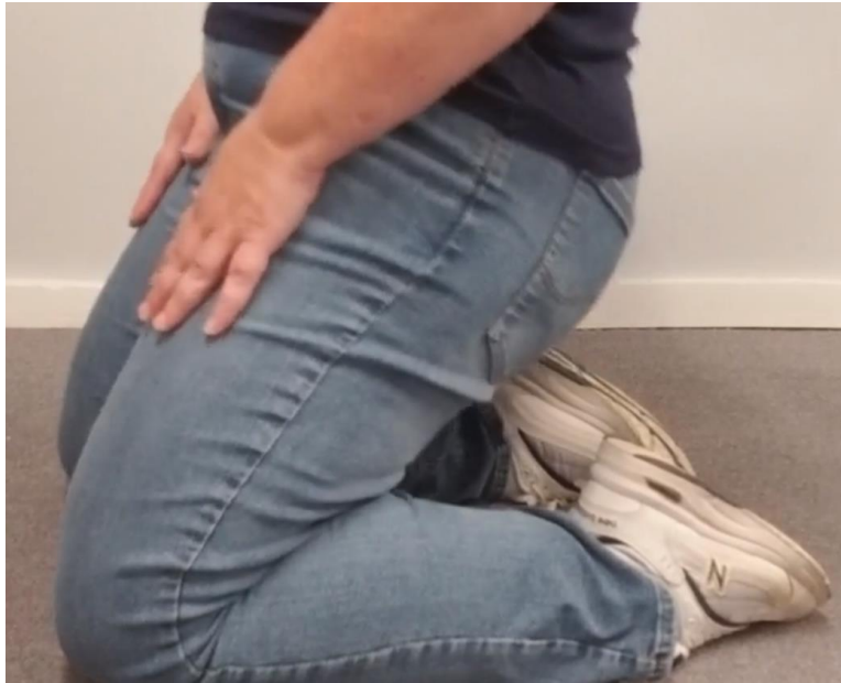
Figure 11 Begin sitting down slowly (but not pressing into your heels). Notice how you use your glutes to sit down softly? Practice this a few times. Rise using your thumbs to guide you lifting from the hips, glutes and thigh muscles. Then sitting using you're your glutes and thighs to lower you back down. Remember to be aware of how this balances your upper body's position as well.

If it feels as if your hips are leading your body, or perhaps ahead of the movement of your body, you are feeling and executing the movement correctly. In fact your hips are not out in front of you. They are the active portion of your body in the movement. Not your upper body.