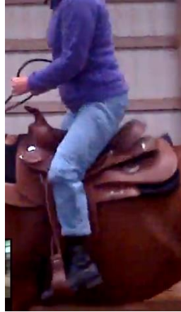
Figure 7 Balanced posting only requires rising out of the saddle 1 to 1 1/2 inches. Anything higher than that will cause the rider to become unbalanced. Using their feet and hands to rebalance themselves.