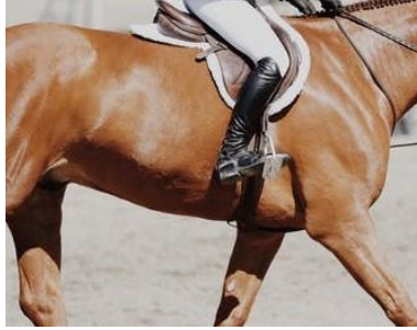
Figure 2 In this photo, the excessive flexion in the rider's heel creates incorrect body position. The heel and lower calf are always against the horse and the rider does not have balanced contact in their saddle. All the weight is now carried on the horse's front end.