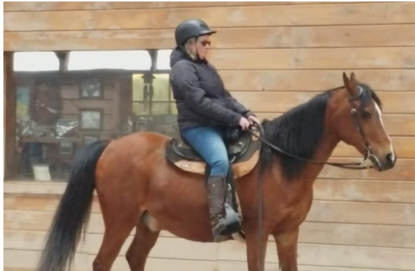
Figure 3 When the heel is driven downward, the knee begins to straighten. The rider is pushed to the rear of the saddle. Causing the pelvic bones to push down into the horse's back and lifting the rider out of the saddle and out of balance.

From your chair, sit in your neutral position and relax your leg. Now, flex your heels as much as you can. Pull all your toes upward, push your heels down and notice what your