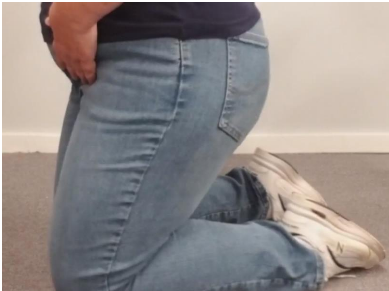
Figure 10 Begin by kneeling on the ground. Make sure your toes are pointed away from your body, not bent under the foot. Hips are shoulder width apart.